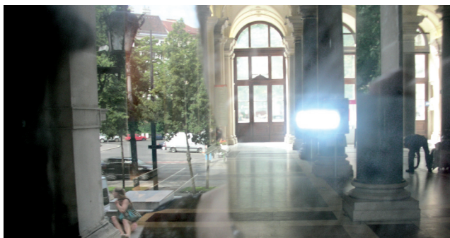
University of Vienna http://phaidra.univie.ac.at/o:57235

Phaidra is available to all employees and students at the University of Vienna.